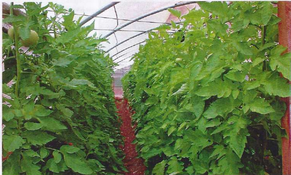
Latent Heat Convertors reduce relative humidity in the greenhouse and thereby reduce incidence of disease.

*Sensible Heat (or enthalpy) is defined as the heat energy absorbed or transmitted by a substance during a change of temperature which is not accompanied by a change of state