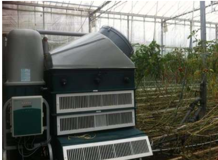
AGAM unit at Dutch organic tomato grower Greenshield at the end of the cropping season.

Controlling the humidity inside a controlled environment is one of the most discussed concerns amongst greenhouse growers. A solution that is more often noticed by growers are the so called Ventilated Latent Heat Converters (VLHC); These units extract humid air from inside the greenhouse and convert water vapour into water and heat by blowing the air through a matrix of desiccant-filled elements in a compact cooling tower. This results in a better climate, less disease pressure and energy saving. At the IPM Essen last month, Chaim Edelman of VLHC developer Agam told us that growers all over the world are showing more interest in this solution.