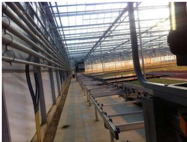
Agam unit at UK baby leaf grower Westland Nurseries

The Agam VLHC unit allow the growers to realize a better internal ventilation by keeping the window vents closed. Keeping the vents close leads to less energy spills as well. Edelman: "As well as this the VLHC will convert the humidity of the plants in to energy; warm, dry air that can be used to heat the greenhouse again and save energy. Because the humid air is not only converted into dry warm air, but is also being treated and filtered; the level of fungus and other plant diseases in the greenhouse will decrease."